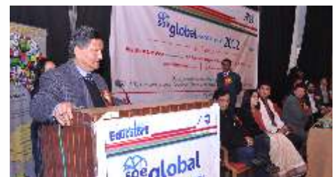
Mr. H.S. Bhrahma Chief Election Commissioner of India