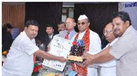
H.R. Public School